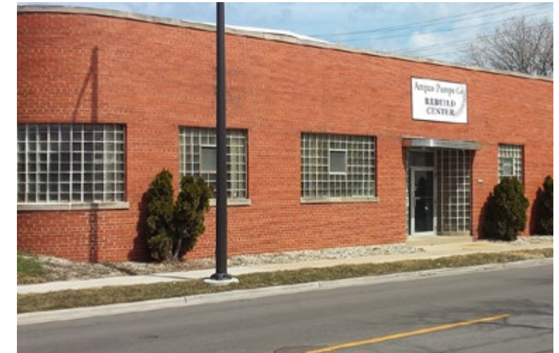
Pump Remanufacturing Center – Milwaukee, Wisconsin

The designs of competing pumps have not changed in decades. When material upgrades aren't sufficient, we innovate: The patented ZP3 and patented ZP1+; AC+ centrifugal pumps; LH close-coupled, and high pressure centrifugal pumps are all examples of the Ampco Advantage. We invite you to see for yourself why Ampco Pumps Company is truly the best sanitary pump manufacturer in the world.