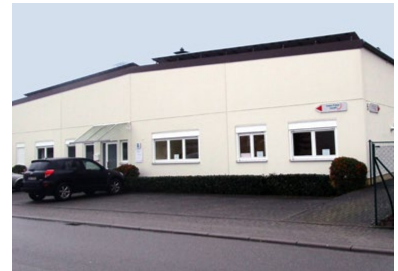
Ampco GmbH offices, warehouse, and assembly facility